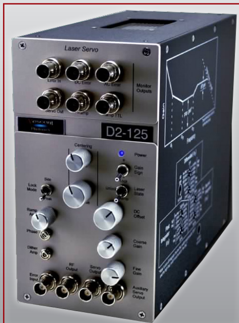
The D2-125 laser Servo

The D2-125 laser servo is designed for low-noise servo control of lasers and other experimental systems. The PI 2 D loop filter, with two-stage integral feedback, provides tight locking to cavities and atomic or molecular transitions. The D2-125 provides full user control over the loop filter parameters, enabling servo loop optimization for a wide variety of plants such as current tuning, acousto- and electro-optic modulators, voice coils, and piezo actuators, etc.