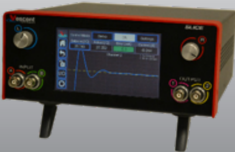
SLICE-QTC temperature controller

With compliance voltages up to 18 V and current outputs up to 6 A, our proprietary low-noise power supply technology makes it easy to control a variety of different plants. DC control (not PWM) means high short-term stability and no radiated noise.