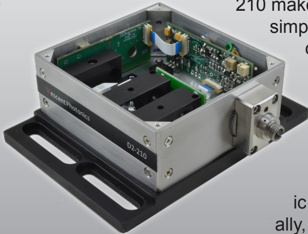
D2-210 Spectroscopy Module

Vescent Photonics' D2-210 second-generation Spectroscopy Module makes locking to atomic transitions easier and more powerful than ever before. Completely redesigned to maximize performance in a number of laser-locking environments, the D2-210 makes atomic absorption-referenced frequency locks simple. Designed to work as a general-purpose frequency discriminator, it is compatible with our D2-125 Reconfigurable Servo as well as other feedback loop filters.