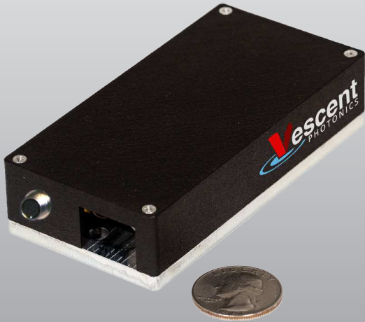
FO-100 Fiber Oscillator

The FO-100 Fiber Oscillator from Vescent Photonics is the engine for your femtosecond laser and frequency comb work. Based on an Er:doped fiber, it delivers sub-200 fs pulses with a bandwidth of over 15 nm, given an appropriate pump input and thermal control loops (not included). Additionally, it features our unique PZT-based cavity length adjustment tool. With an appropriate user-supplied signal, >100 Hz of fine control over the repetition rate is possible. In combination with coarse temperature tuning and factory centering, one can precisely set the repetition rate - including matching the repetition rates of two oscillators for applications such as dual-comb spectroscopy.